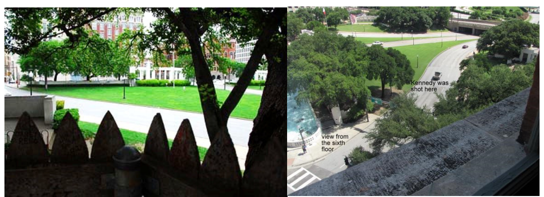
Left – View from the fence line to the right of where JFK was shot, behind a grassed hill. Right – View from the 6^{th} floor of the Texas Book Depository, where Oswald allegedly was. Where would you take the 'money shot' from?

* So for this 'leaky boat' of the public WC findings is to stay afloat, there could be no more than three bullets fired. If there was more shots fired, then there had to be at least one other shooter, as it was not possible within the accepted timeframes for Oswald (or whoever was up there shooting) to have fired more than three bullets. The physical evidence clearly shows there were more than three bullets and that the 'single bullet theory' is pure fiction.