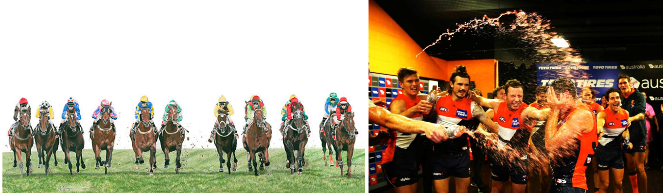
L - An artist's impression (Maryanne Lillecrapp) of the 2005 Cox Plate field as they neared the turn. R - GWS - Will their Cup runneth over in 2017 (and 2018, and 2019 and...)?

For all intents and purposes, at that stage of the race, these horses were all equally placed, it was a close race. But there was one mare travelling so much better than all the others, keeping stride with the others with minimal exertion, with so much more to give.